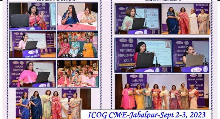
ICOG CME-Jabalpur-Sept 2-3, 2023