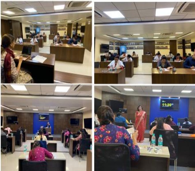
Glimpses of RM,FM,Endo Examination at FOGSI Office