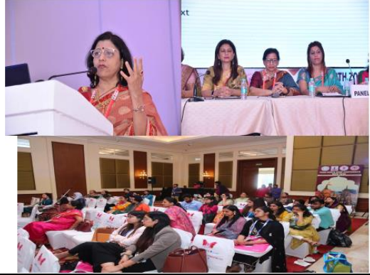
ICOG Session at Calicut-South Zone FOGSI Conference with YUVA February 24-26, 2023