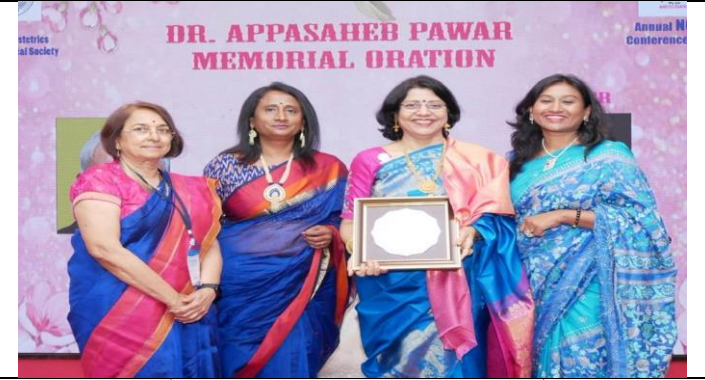
ICOG CME at OGSSI-30.04.2023