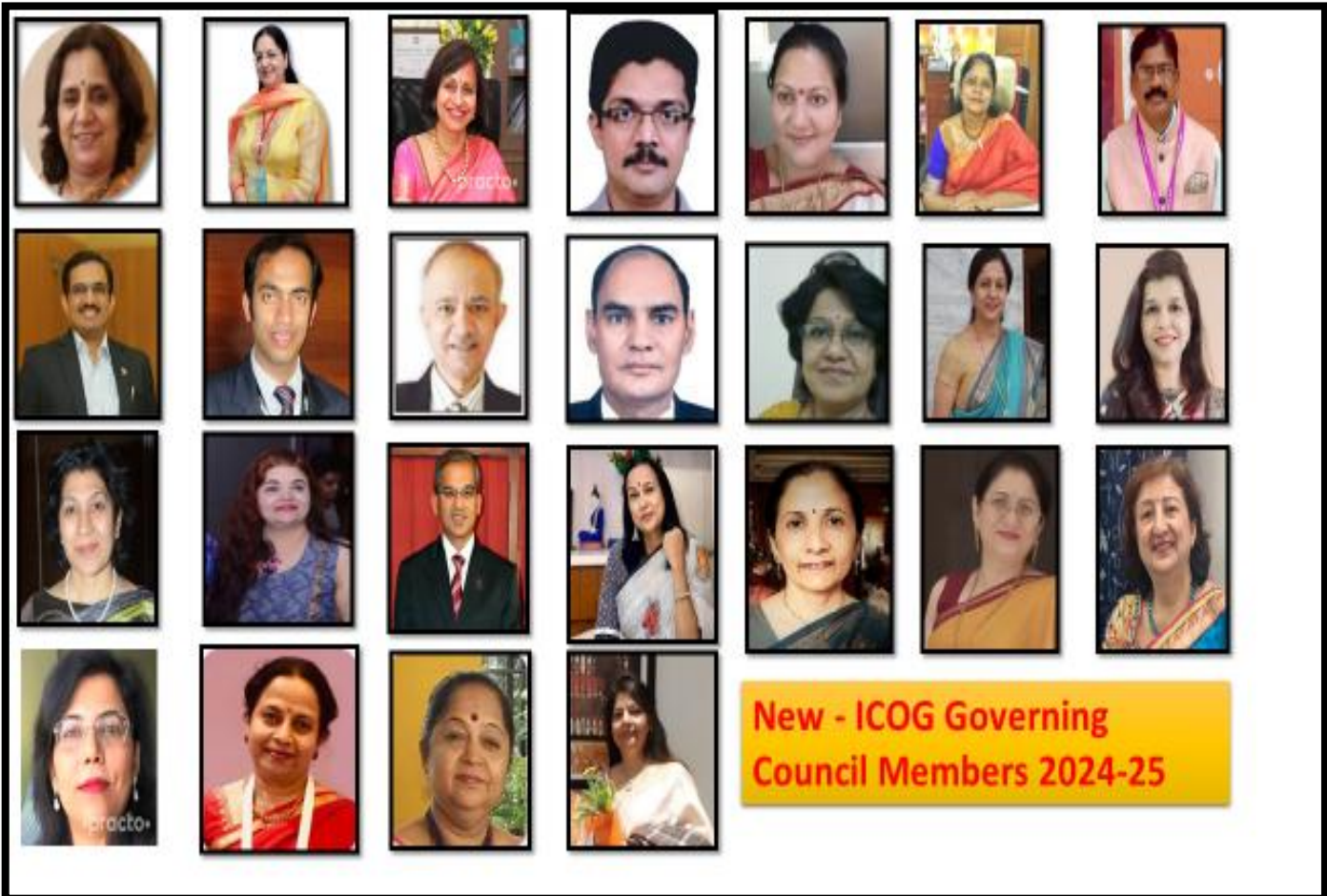
Lucknow Ob-Gyn Society: 30.12.2023